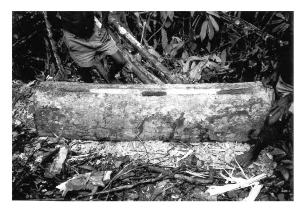
FIGURE 4. The work of kengiau complete.

into the bush from the tip of the trunk with a great shout. Men say at this point that this 'opens' the ears of the slit-gong. The notion of reciprocity or response appears to be built into the object in the very construction. The concern expressed is not, as yet, that it shall have a good voice, but explicitly that it shall be able to hear. Another stick, this time from a light hardwood tree, is brought, and this beater ( tokung maning ) is said to be a 'good' stick which will produce the correct response from the slit-gong. It is not thrown away.