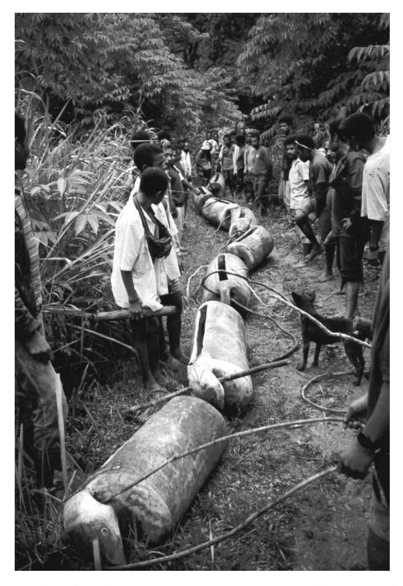
FIGURE 6. A line of new slit-gongs awaits emergence outside Reite village in 1995.

which it emerges. (Production is particular, a consequence of affinal relations). A voice is always a version of other peoples' voices. It displaces another voice, just as a presentation of wealth displaces the body of a bride.