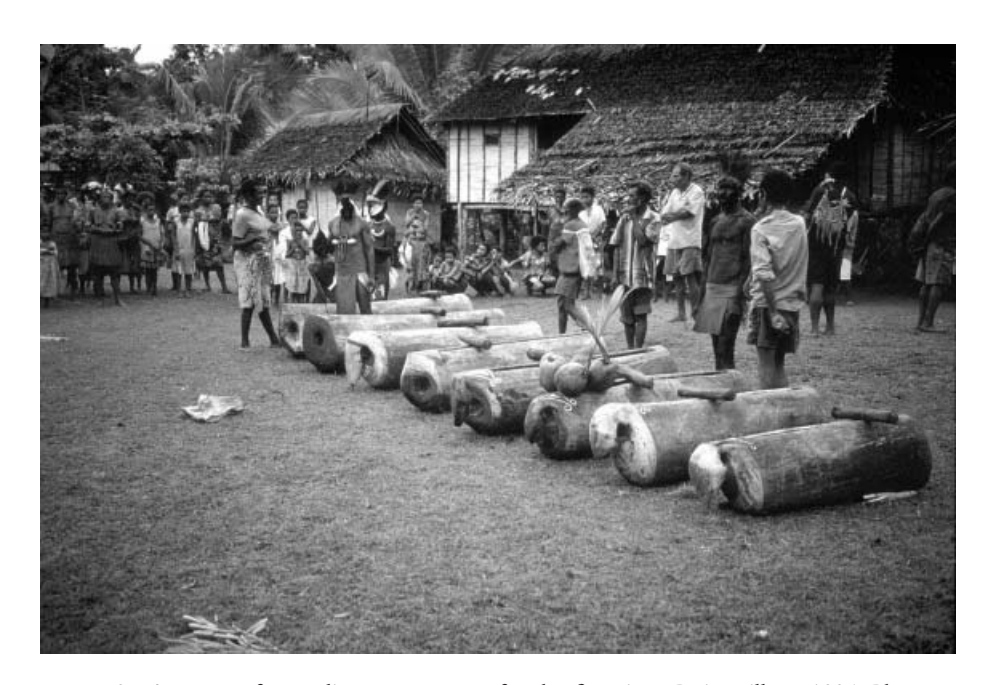
Figure 3. A group of new slit-gongs appears for the first time. Reite village, 1995.